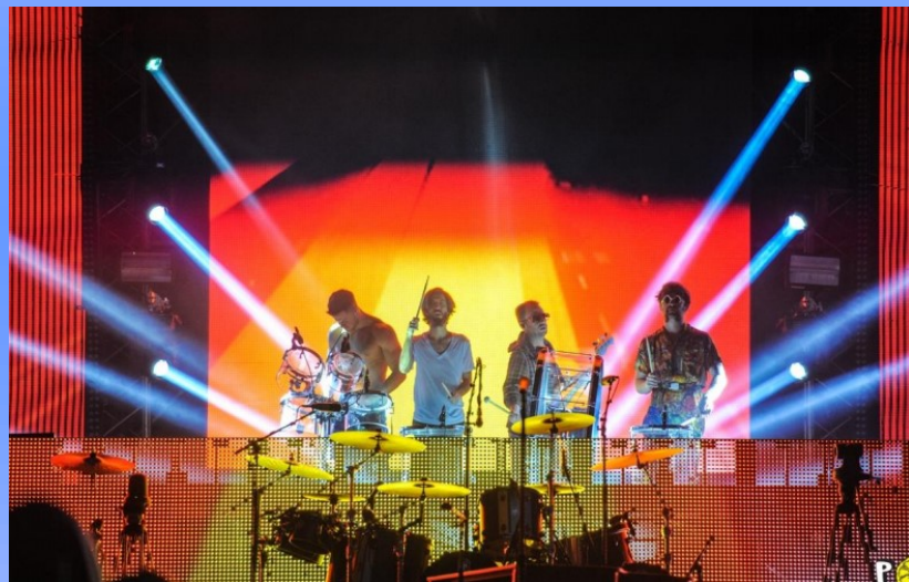
Imagine Dragons are performing their breathtaking hit

And here is the long-awaited moment: my favorite band enters the scene. I can't believe that it's really happening to me. It's almost impossible to hear any sound from the stage because of fans' shouting.