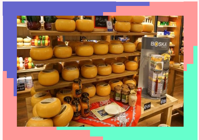
More than 140 kinds of cheese are produced at the cheese factor

Along with tulips and windmill, there is another symbol of the country – klompen: the traditional all-wooden Dutch clogs. These are the most favourite Dutch souvenirs for tourists. However, some Dutch people, particularly farmers, market gardeners, and gardeners still wear them for everyday use. Outside the tourist industry, klompen can be found in local tool shops and garden center.