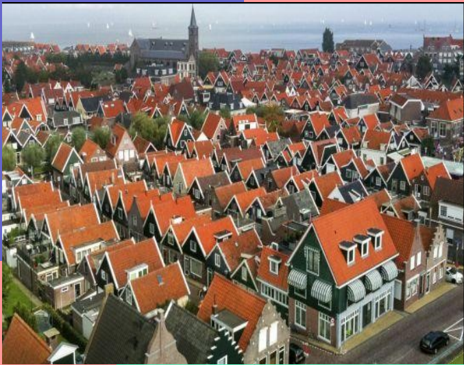
A bird's eye view of Volendam

Amsterdam can be thrilling, but any native will tell you: to really experience everyday life in the Netherlands, get