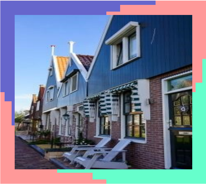
Doolhof and Oude Kom quarters

Walking around Volendam, everyone gets impressed with the town's unique architecture.